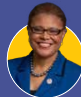
United States Congresswoman Karen Bass

Removing local renter protections now would be a devastating blow to the entire Culver City community. That's why I'm asking you to vote No on B in November. ”