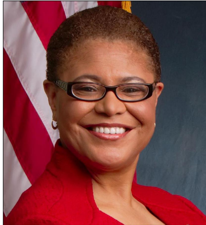
AD 54 Democrat of the Year Karen Bass

Our Club proudly announces that four of our members were honored: