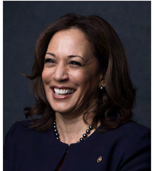
The road ahead will not be easy, but America is ready. And so are Joe and I.

The hard work. The necessary work. The good work. The essential work to save lives and beat this pandemic. To rebuild our economy so it works for working people. To root out systemic racism in our justice system and society. To combat the climate crisis. To unite our country and heal the soul of our nation.